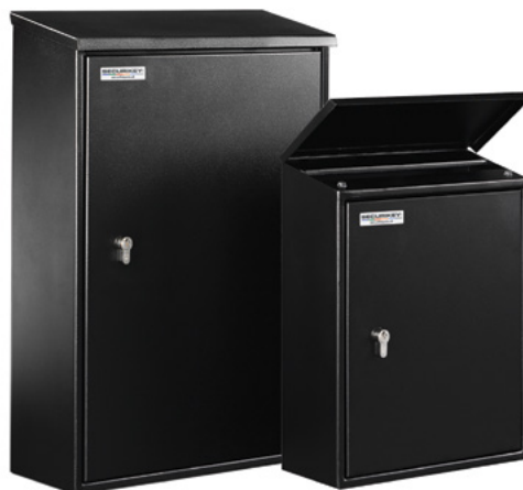
High Security Range