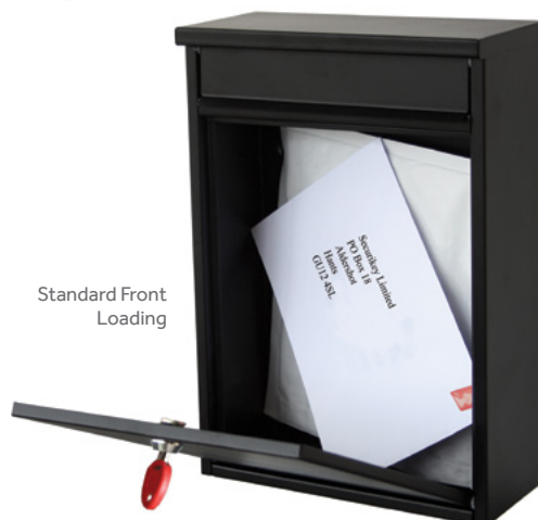
Standard Front Loading