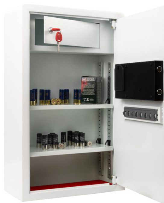
Ammunition Cabinet 200