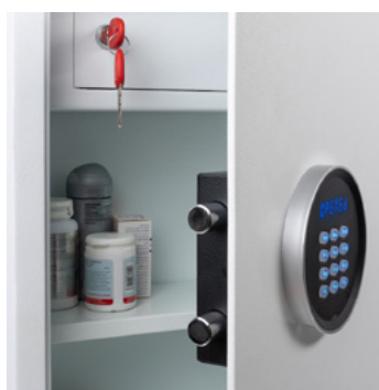
Medicine Cabinet 200D internal