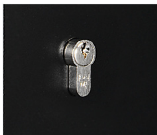
Euro Profile Cylinder Lock