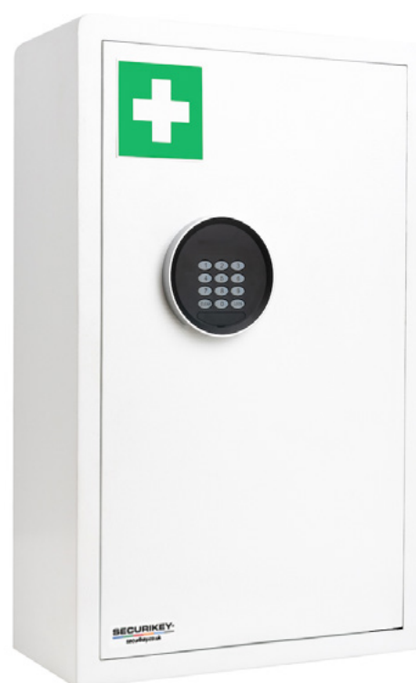
Medicine Cabinet 200D