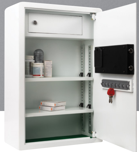
Medicine Cabinet 200D

"Protecting your wealth and health in a variety of environments"