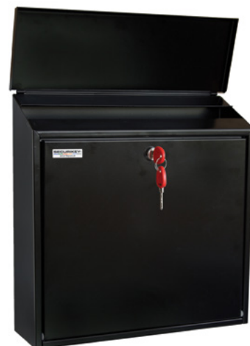
Standard Top Loading