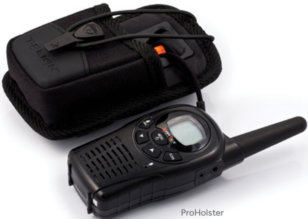
ProHolster (excludes radio)