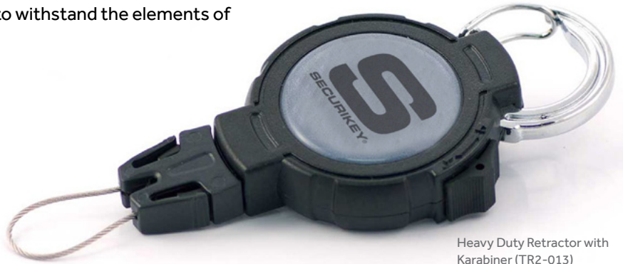
Heavy Duty Retractor with Karabiner (TR2-013)