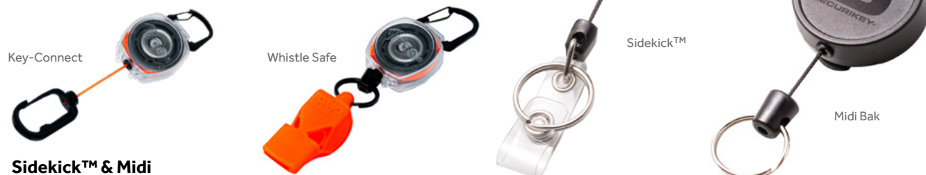
Sidekick™ & Midi

The Sidekick™ range (RSK) does that and more.