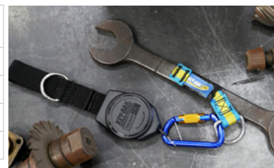
ToolMate® Retractor (RTM-2.25)

*Inbuilt Ratch-It to enable locking cord in position.