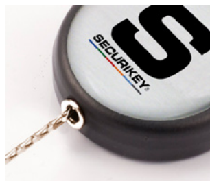
Standard Duty chain (RKCH)

The heavy duty retractable Karabiner holder conveniently attaches to almost everything, making it one of the most widely used Karabiner reels we make. Available with Kevlar® Cord or a Stainless steel chain.