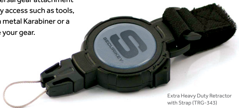
Extra Heavy Duty Retractor with Strap (TRG-343)