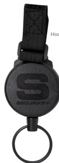
Hook & Loop Fixing