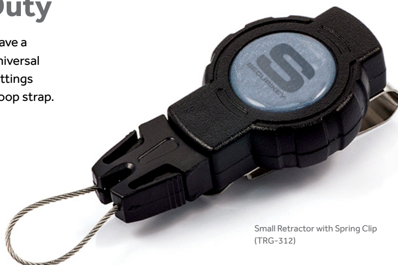
Small Retractor with Spring Clip (TRG-312)