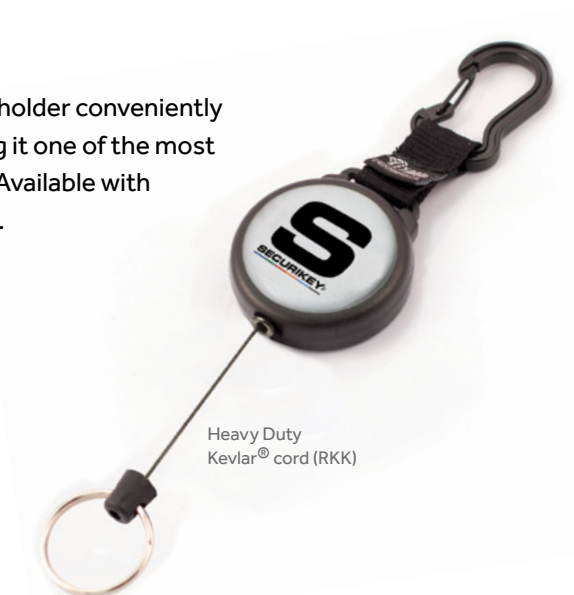
Heavy Duty Kevlar® cord (RKK)