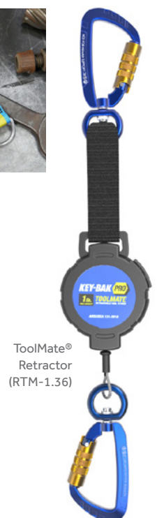
ToolMate® Retractor (RTM-1.36)