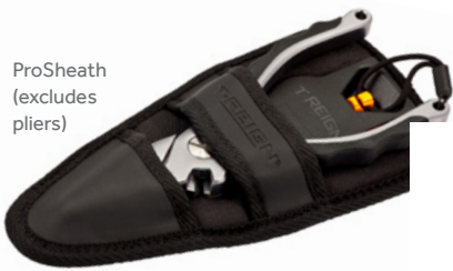
ProSheath (excludes pliers)

ProHolsters are weather and water resistant with inbuilt retractors that require only one hand to operate the catch-and-latch system. Each holster includes rugged Kevlar tether that reaches up to 900mm and the stainless steel retractor spring is proven to last more than 1 million pulls.