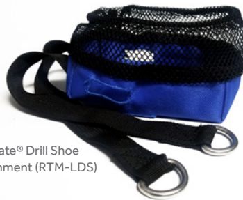
ToolMate® Drill Shoe Attachment (RTM-LDS)