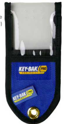
ToolMate® SmartPhone Jacket (RTM-LSPJ)