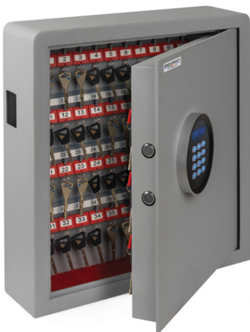
Key Cabinet 70