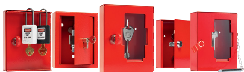
Emergency Key Box Range

Having many of the same features and benefits of our System cabinets, this specialist range of products has been designed to suit specific applications. Examples of this are cabinets designed to house padlocks and keys used to isolate switchgear or machinery, clear fronted cabinets for instant visual check of all stored keys and emergency key boxes to house a restricted key near to a locked door in case of emergency.