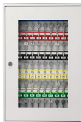
System 50 Key View (page 9)