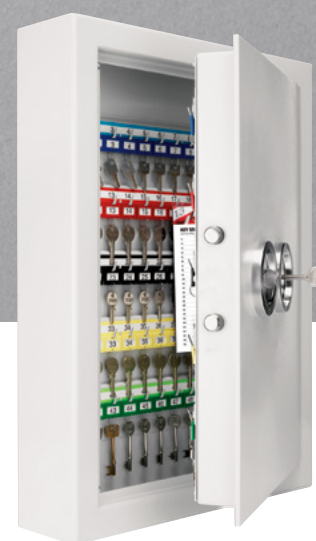
High Security 100

"Tested and certified control for up to 2160 keys"