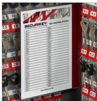
Removable Index sheet