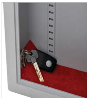
Internal Key Scoop