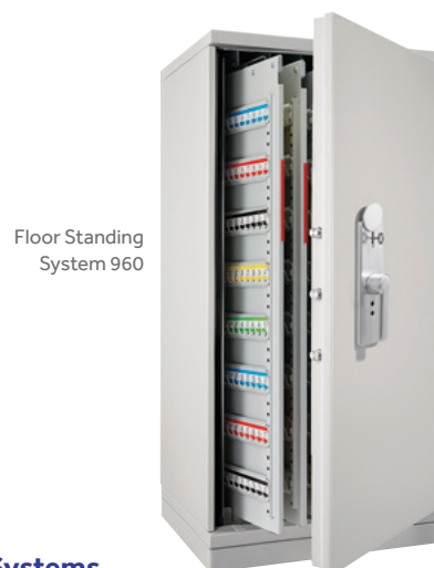
Floor Standing System 960