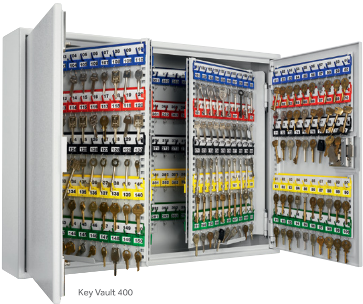
Key Vault 400

Designed to meet the requirements of insurance companies in the control, tracking and security of keys associated with risk to valuables or property, our range of Key Vaults offers double the security and strength provided by our system cabinets.