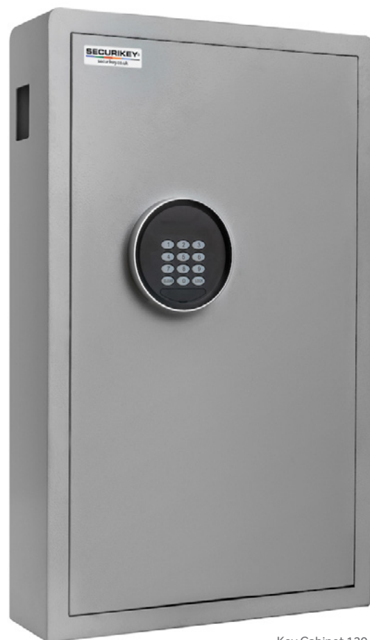
Key Cabinet 120