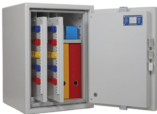
Euro Graded safe with bespoke key rails

Our range of high security key control systems, the most comprehensive available, are manufactured utilising the same technology as our cash safes and tested to the highest standards. This makes them ideal for safeguarding against lost or stolen keys even within high security commercial applications, such as the UK's Prestige Motor Dealers, Police Stations and Banks.