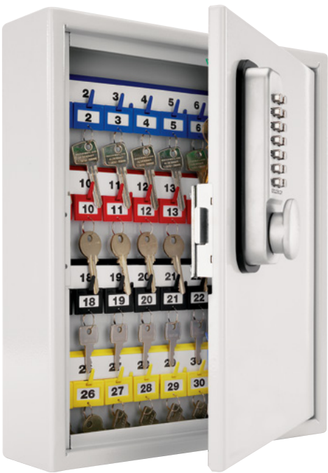
Key Vault with Push Button Combination Lock