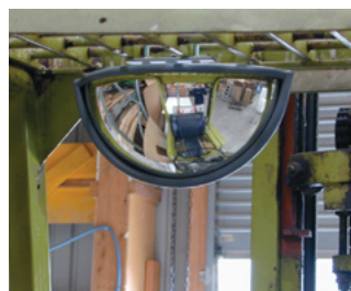
Fork Lift Rear View

The model with four castor wheels allows the mirror to be easily positioned as required while the extra deep convex mirror ensures the maximum viewing area.