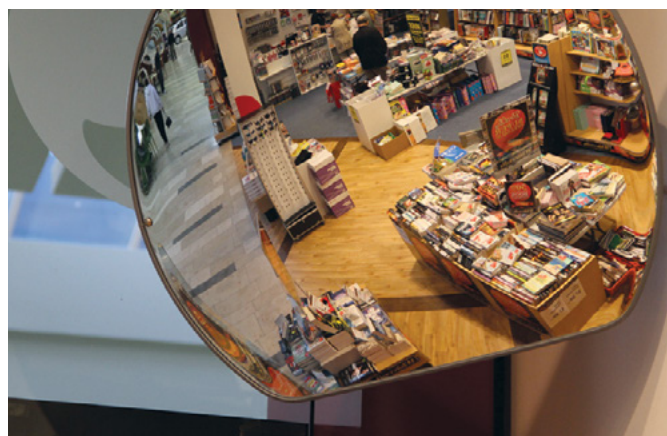
600 x 400 Rectangular

Supplied with bright zinc "J" arm bracket. ACM = Aluminium Composite Material.