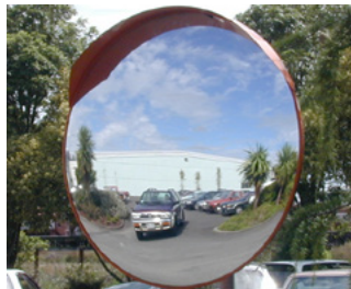
Exterior Deluxe HD