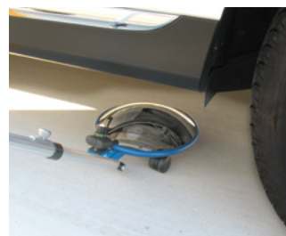
Heavy Duty Inspection with Light