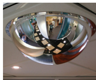
Full 360° Dome