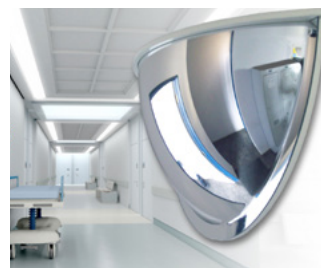
Deluxe Half Face