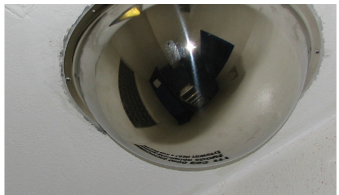
Secure Institutions Full Dome