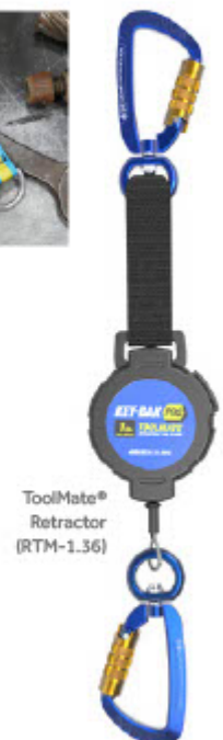
ToolMate® Retractor (RTM-1.36)