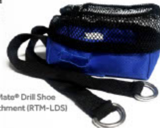
ToolMate® Drill Shoe Attachment (RTM-LDS)