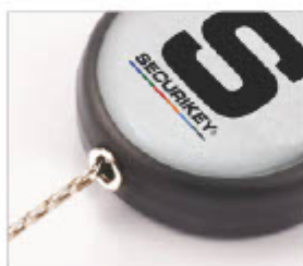
Standard Duty chain (RKCH)

The heavy duty retractable Karabiner holder conveniently attaches to almost everything, making it one of the most widely used Karabiner reels we make. Available with Kevlar® Cord or a Stainless steel chain.