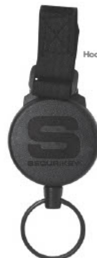
Hook & Loop Fixing