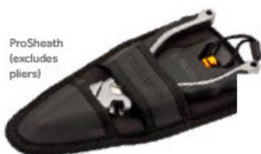
ProSheath (excludes pliers)

ProHolsters are weather and water resistant with inbuilt retractors that require only one hand to operate the catch-and-latch system. Each holster includes rugged Kevlar tether that reaches up to 900mm and the stainless steel retractor spring is proven to last more than 1 million pulls.