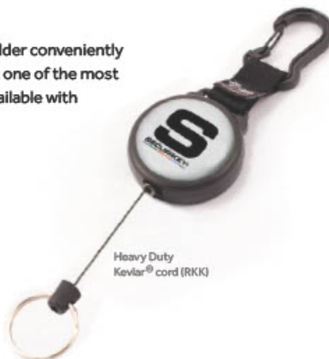
Heavy Duty Kevlar® cord (RKK)