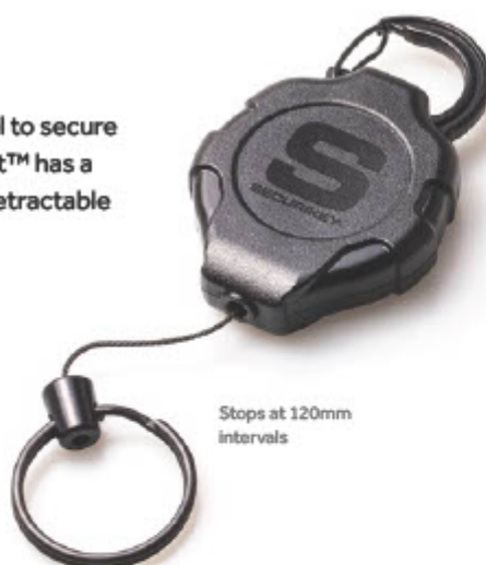
Stops at 120mm intervals