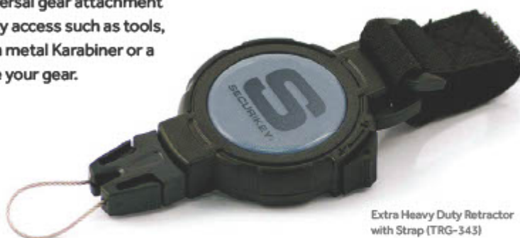
Extra Heavy Duty Retractor with Strap (TRG-343)