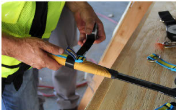
ToolMate® Link Strap Attachment with D-ring (RTM-LS2.25) used with Attachment Tape (RTM-LTR)

This innovative range of retractable tethers and link tool attachments provide protection to a wide variety of tools and equipment, preventing them being dropped and damaged as well as alleviating accidents in the workplace. Tested and approved to ANSI / ISEA 121-2018.