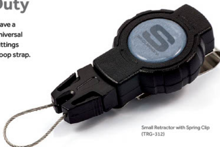
Small Retractor with Spring Clip (TRG-312)