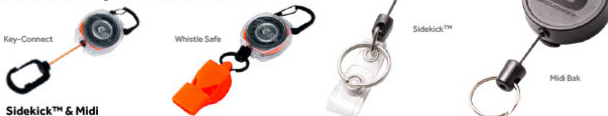
Sidekick™ & Midi

Office and nursing professionals want a retractable key and badge reel that will hold their keys and other small items (like a USB drive) as well as their ID badges. The Sidekick™ range (RSK) does that and more.