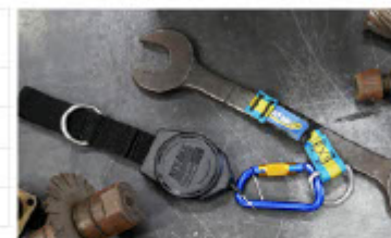
ToolMate® Retractor (RTM-2.25)

*Inbuilt Ratch-It to enable locking cord in position.