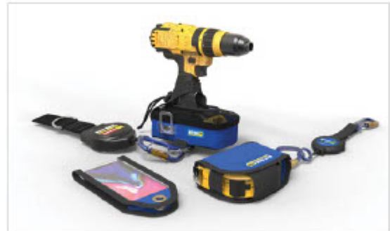
ToolMate® Drill Shoe Attachment with Retractable Tool Tether (RTM-2.25) SmartPhone Jacket (RTM-LSPJ) and Tape Measure Jacket (RTM-LTMJ) with Retractable Tool Tether (RTM-0.45)