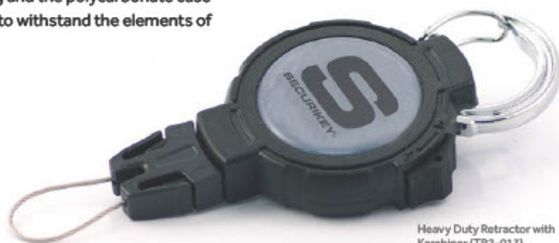
Heavy Duty Retractor with Karabiner (TR2-013)