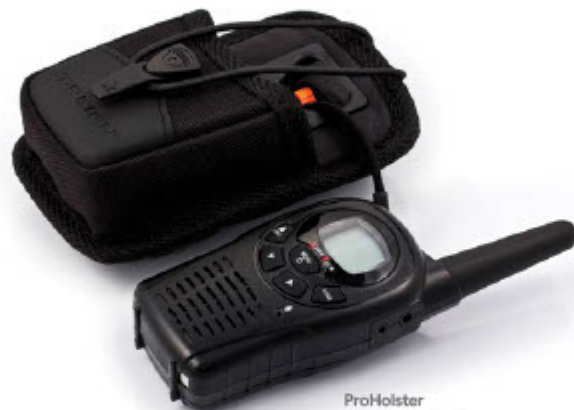
ProHolster (excludes radio)