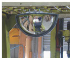
Fork Lift Rear View

The model with four castor wheels allows the mirror to be easily positioned as required while the extra deep convex mirror ensures the maximum viewing area.