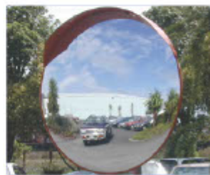
Exterior Deluxe HD