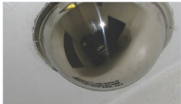
Secure Institutions Full Dome