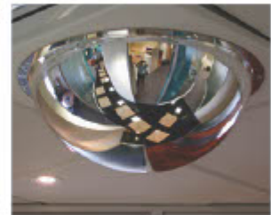
Full 360° Dome