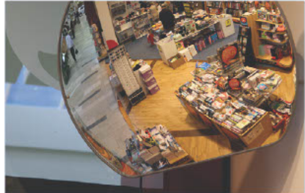
600 x 400 Rectangular

Supplied with bright zinc "J" arm bracket. ACM = Aluminium Composite Material.