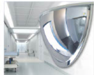
Deluxe Half Face