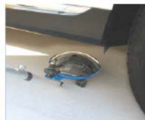
Heavy Duty Inspection with Light