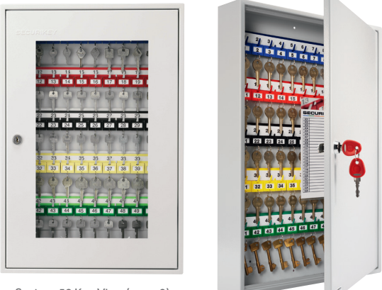
System 50 Key View (page 9)