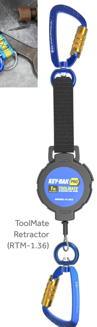
ToolMate Retractor (RTM-1.36)