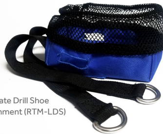
ToolMate Drill Shoe Attachment (RTM-LDS)