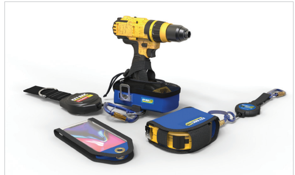
ToolMate Drill Shoe Attachment with Retractable Tool Tether (RTM-2.25) Smartphone Jacket (RTM-LSPJ) and Tape Measure Jacket (RTM-LTMJ) with Retractable Tool Tether (RTM-0.45)