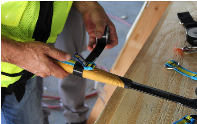
ToolMate Link Strap Attachment with D-ring (RTM-LS2.25) used with Attachment Tape (RTM-LTR)

This innovative range of retractable tethers and link tool attachments provide protection to a wide variety of tools and equipment, preventing them being dropped and damaged as well as alleviating accidents in the workplace. Tested and approved to ANSI / ISEA 121-2018.