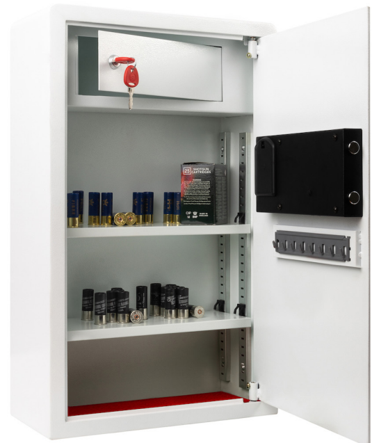
Ammunition Cabinet 200