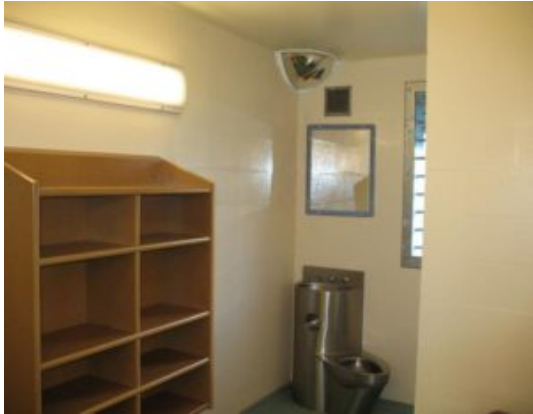
Flat Anti-Ligature Vanity Mirror