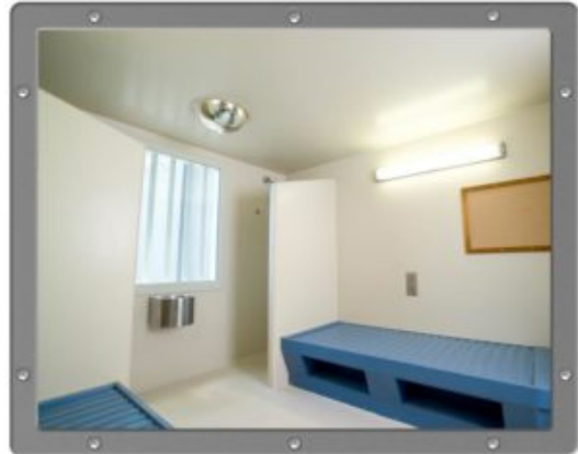
Flat Anti-Ligature Vanity Mirror