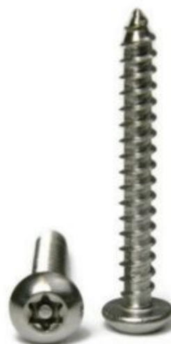
Vanity Mirror Fixing Screw