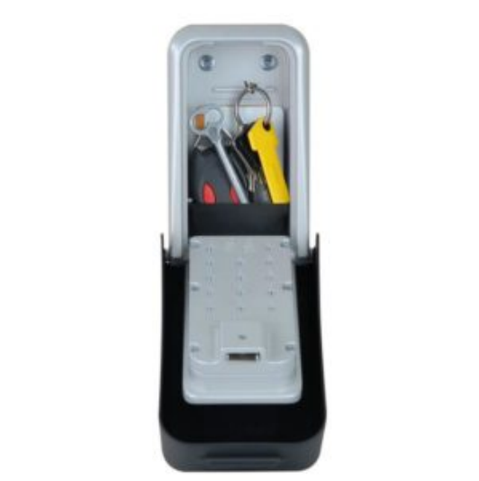
5426D High Security Key Safe