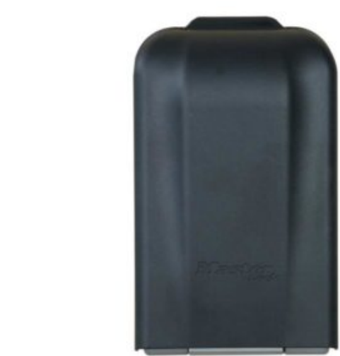
5426D High Security Key Safe