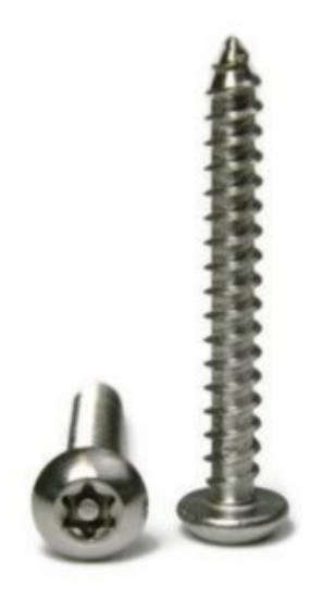
Vanity Mirror Fixing Screw