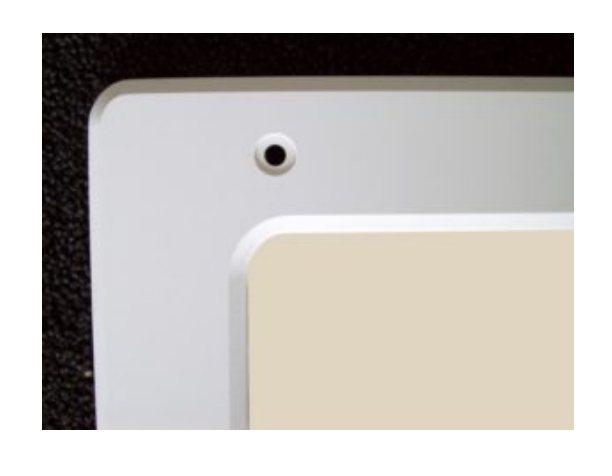
Vanity Mirror Fixing Hole Detail