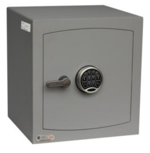
Mini Vault 3 S2 Gold FR Electronic Locking