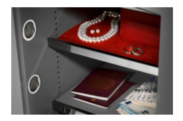
Mini Vault Jewellery Shelf