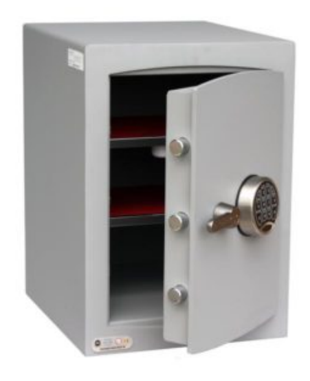
Mini Vault 2 S2 Gold FR Electronic Locking