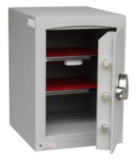
Mini Vault 2 S2 Gold FR Electronic Locking