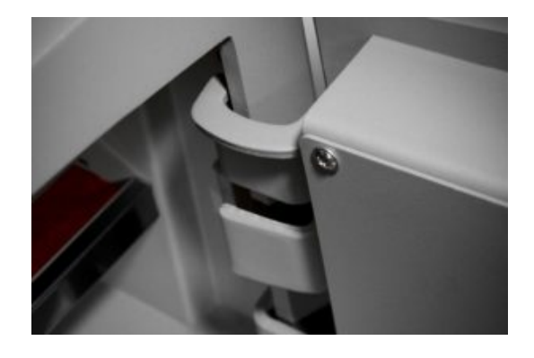
Mini Vault Hinge & Dog Bolt