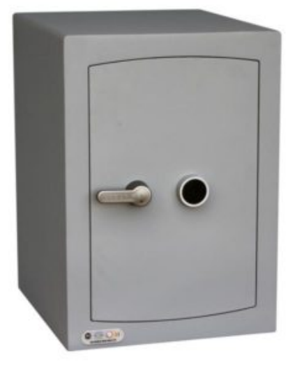
Mini Vault 2 S2 Gold FR Key Locking