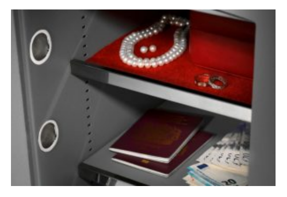
Mini Vault Jewellery Shelf