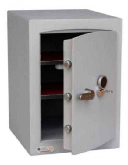
Mini Vault 2 S2 Gold FR Key Locking