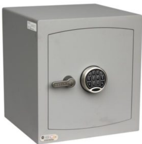
Mini Vault 3 S2 Silver Electronic Locking