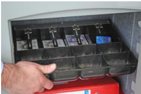
Mini Vault 3 & Till Draw