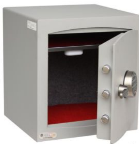
Mini Vault 3 S2 Silver Electronic Locking