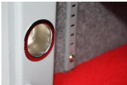
Mini Vault Chrome Bolt Cup