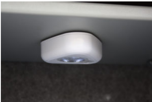
Motion Activated Magnetic Light