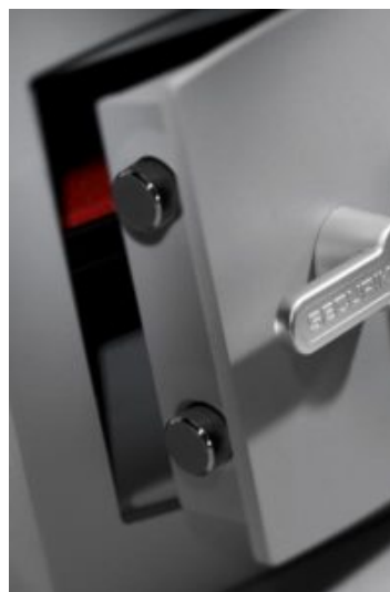
Mini Vault Bolts & Handle