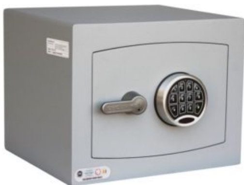
Mini Vault 1 S2 Silver Electronic Locking