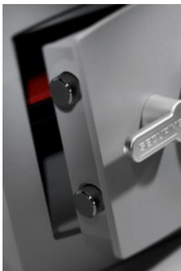
Mini Vault Bolts & Handle