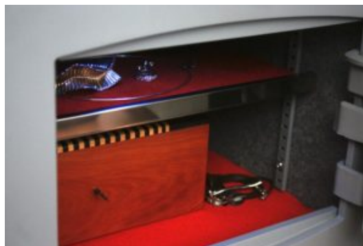
Mini Vault Jewellery Shelf