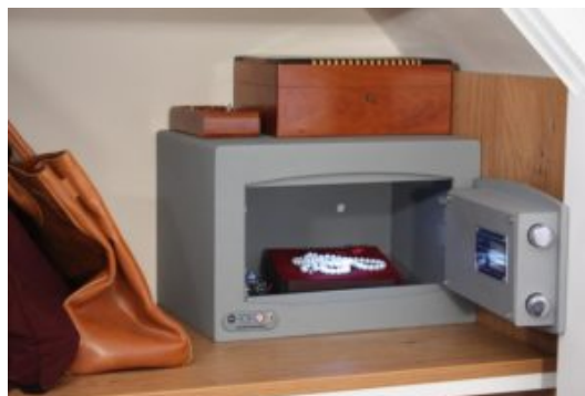
Mini Vault 0 S2