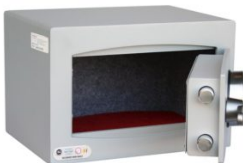
Mini Vault 0 S2 Silver Electronic Locking