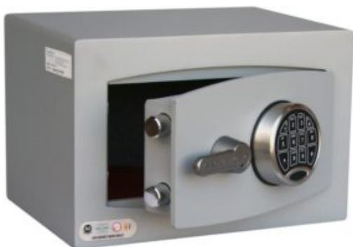
Mini Vault 0 S2 Silver Electronic Locking