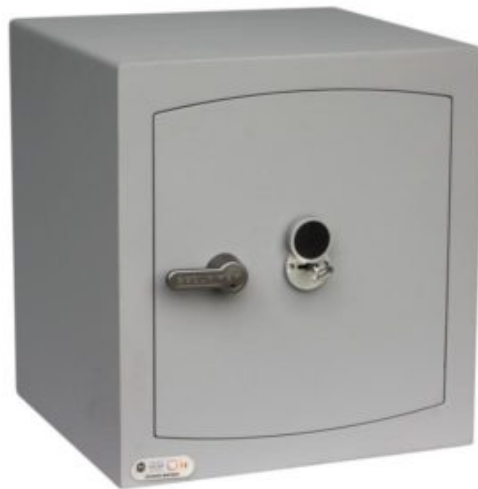
Mini Vault 3 S2 Silver Key Locking