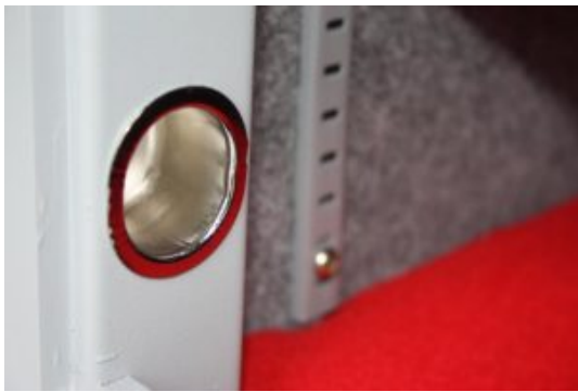
Mini Vault Chrome Bolt Cup