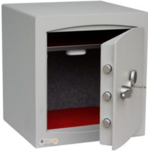
Mini Vault 3 S2 Silver Key Locking