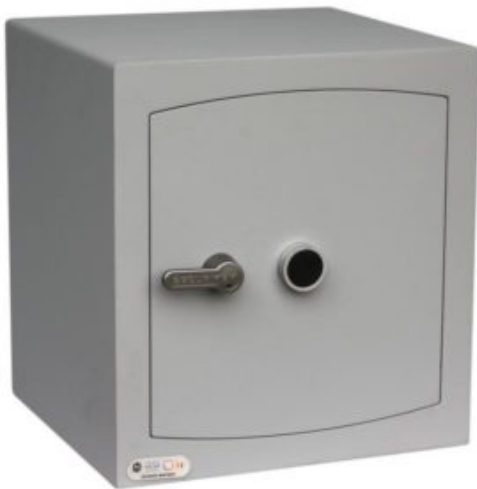
Mini Vault 3 S2 Silver Key Locking