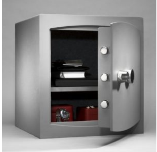
Mini Vault 3 S2 Key Locking Safe