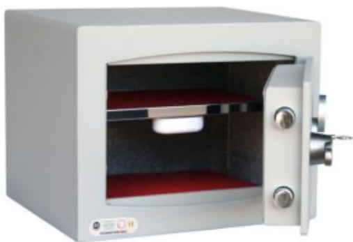
Mini Vault 1 S2 Silver Key Locking