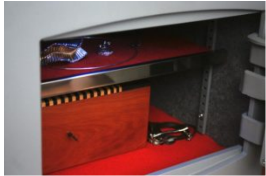
Mini Vault Jewellery Shelf