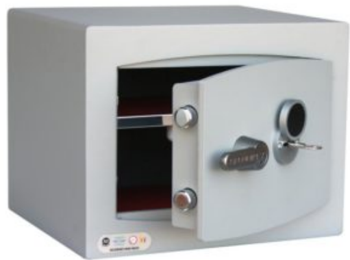
Mini Vault 1 S2 Silver Key Locking