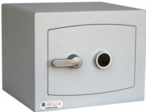
Mini Vault 1 S2 Silver Key Locking