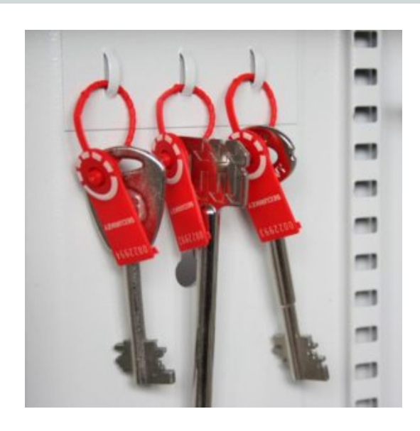
Security Seals & Loops

System 100 Padlock CL1000 Electronic Cam Lock