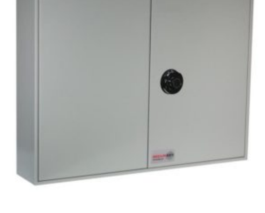
System 100 Padlock Dial Combination Lock