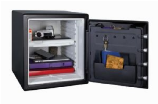
2 Hour Digital Fire Safe X Large LTW123GTC