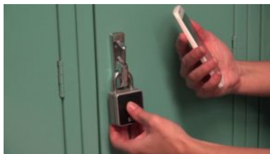
Bluetooth® Smart Indoor Padlock