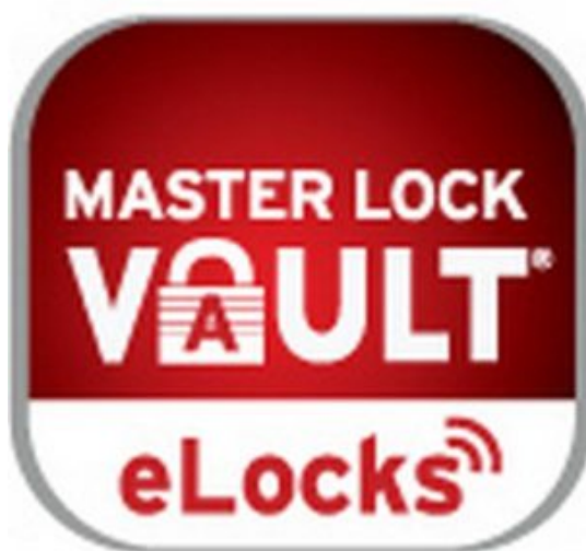
Master Lock Vault App