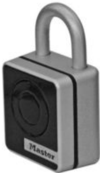
Bluetooth® Smart Indoor Padlock