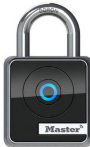
Bluetooth® Smart Indoor Padlock