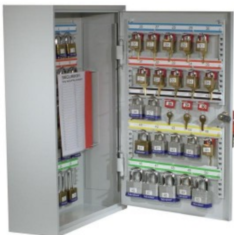
System 50 Padlock