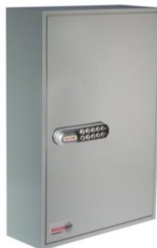
System 50 Padlock CL1000 Electronic Cam Lock