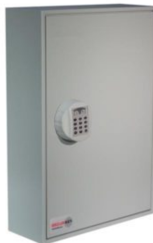
System 50 Padlock - Electronic Lock REVO A