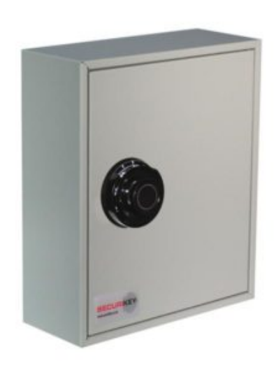
System 24 Padlock Dial Combination Lock