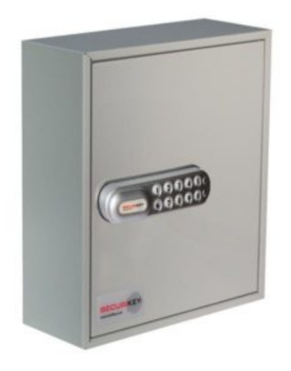
System 24 Padlock CL1000 Electronic Cam Lock