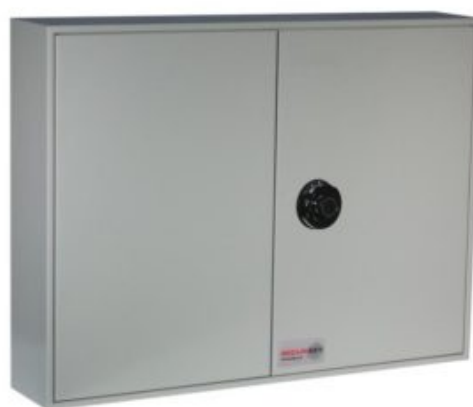
Deep System 200 Dial Combination Lock