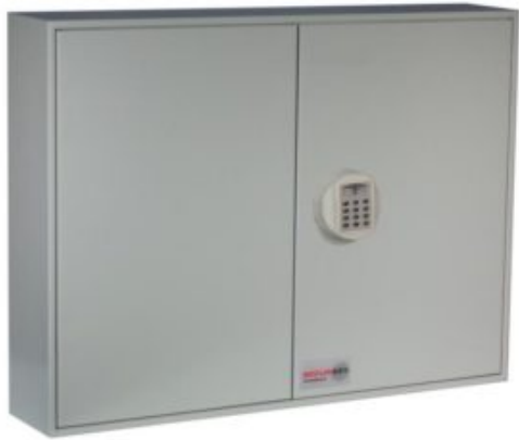
Deep System 200 Electronic Lock REVO A