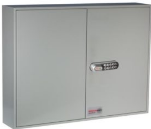
Deep System 200 Electronic Cam Lock CL1000