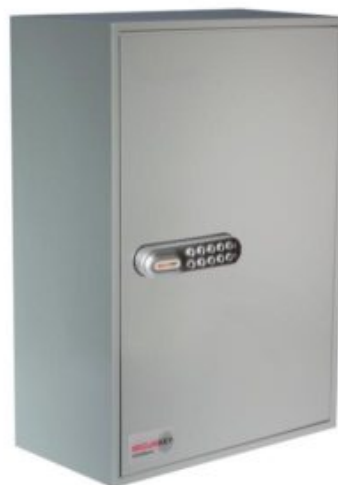
Deep System 150 Electronic Cam Lock CL1000