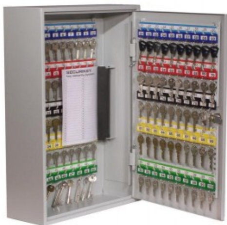
Deep System 100