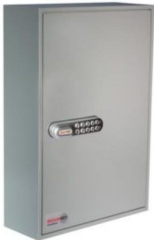
Deep System 100 Electronic Cam Lock CL1000