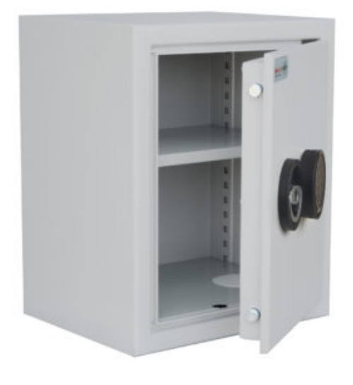
Secure Stor SC065 with electronic Lock open