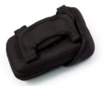
X Large Pro Case Black