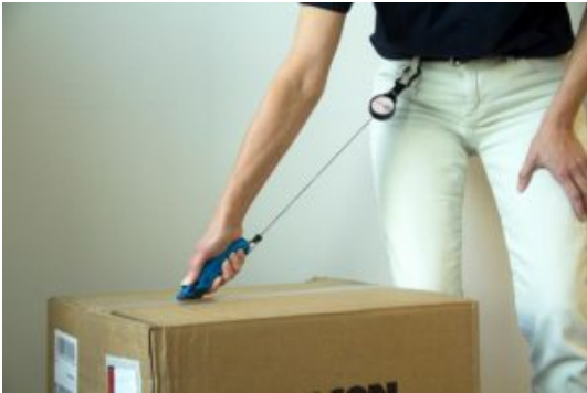
RKRKN Retractor With Safety Knife