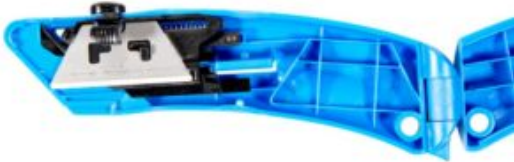
RKRKN Safety Knife - Open