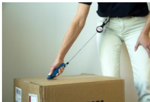
RKRKN Retractor With Safety Knife