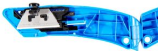
RKRKN Safety Knife - Open