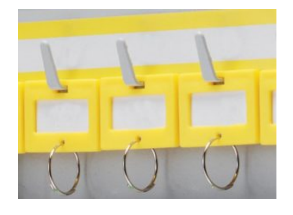
Yellow Key Tabs