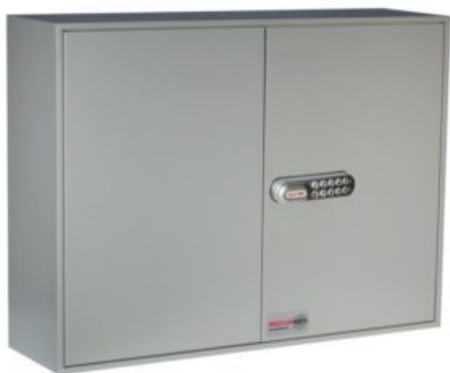
System 600 CL1000 Electronic Cam Lock