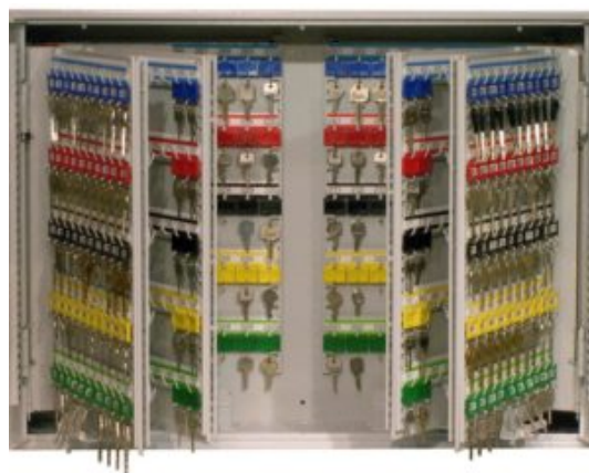
Double Door Key Cabinet