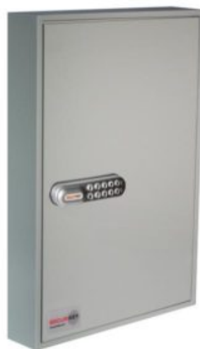
System 100 CL1000 Electronic Cam Lock