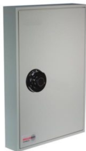
System 100 Dial Combination Lock