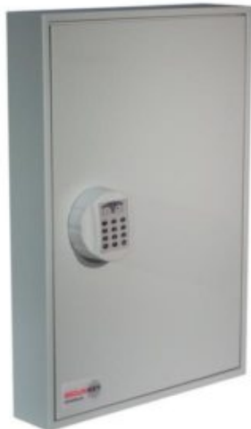
System 20 Electronic Lock REVO A