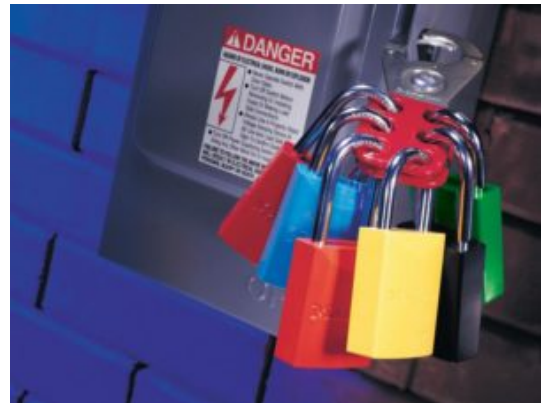
Scissor Type Safety Lockout Hasp