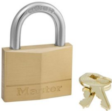
50mm Brass Padlock