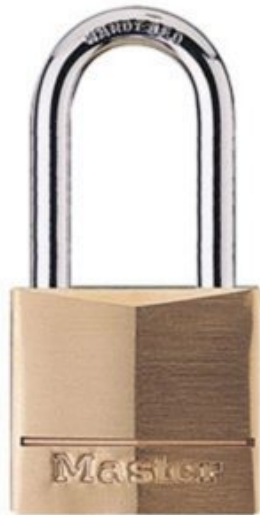
40mm Brass Padlock 38mm Shackle