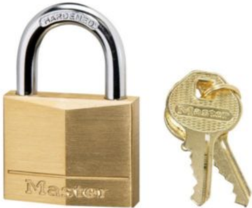
40mm Brass Padlock