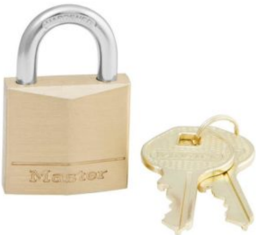
30mm Brass Padlock