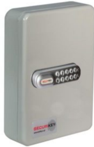
System 30 CL1000 Electronic Cam Lock