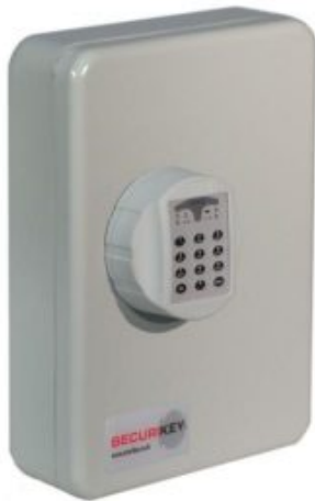
System 30 Electronic Lock REVO A