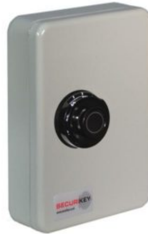
System 30 Dial Combination Lock