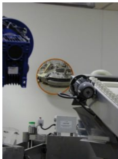
450mm Stainless Steel Food Processing Mirror