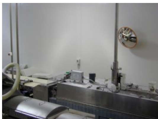
450mm Stainless Steel Food Processing Mirror