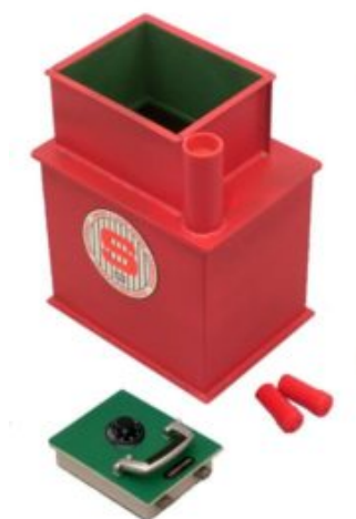
Protector Minor 3 Dial Combination Lock