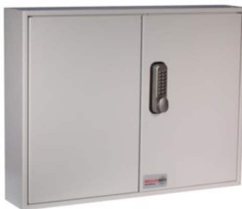
Key Vault 400 Push Button Combination Lock