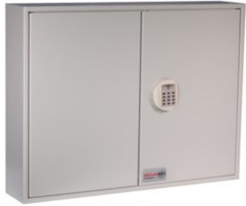
Key Vault 400 Electronic Lock REVO A