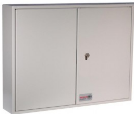
Key Vault 400