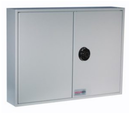
Key Vault 400 Dial Combination Lock