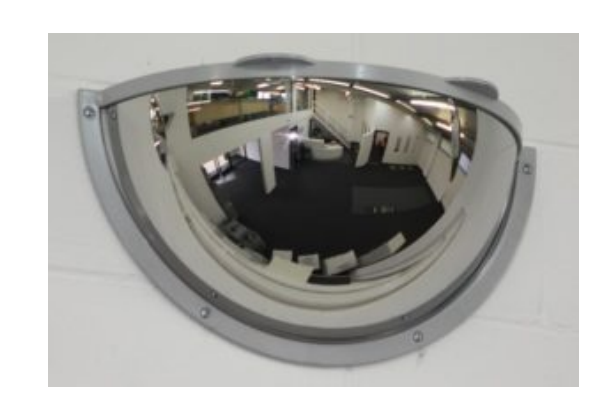
500 x 250mm Half Face Stainless Institution Mirror