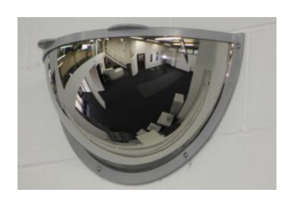
500 x 250mm Half Face Stainless Institution Mirror