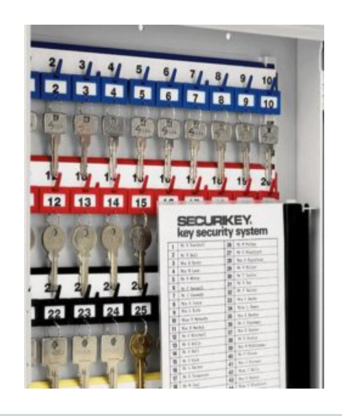
Key Vault Interior