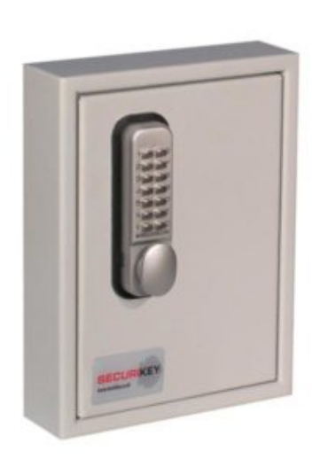
Key Vault 30 Push Button Combination Lock