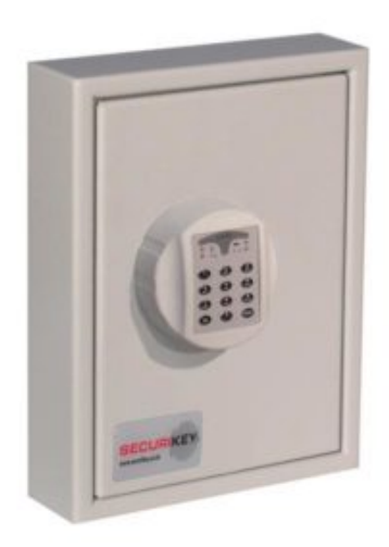
Key Vault 30 Electronic Lock REVO A