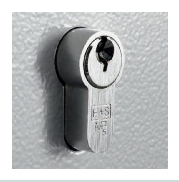
Euro Profile Cylinder