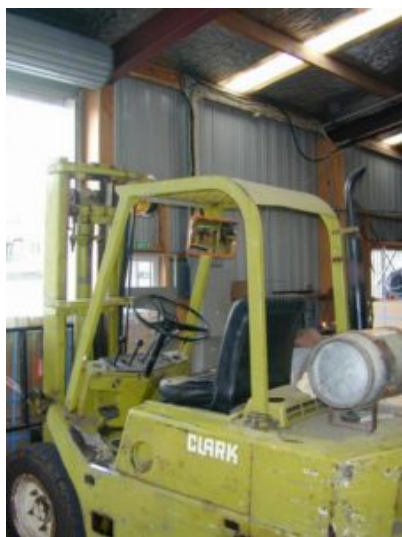
320 x 225mm Stainless Steel Traffic Mirror