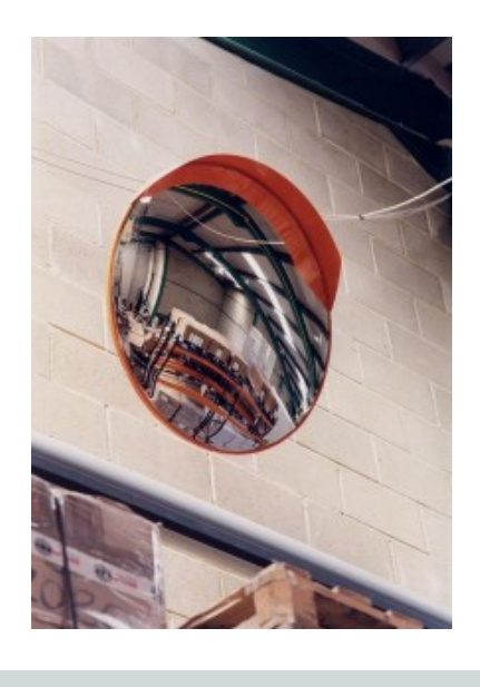
600mm Stainless Steel Anti-Vandal Mirror