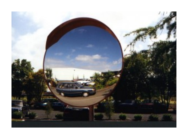
600mm Stainless Steel Anti-Vandal Mirror