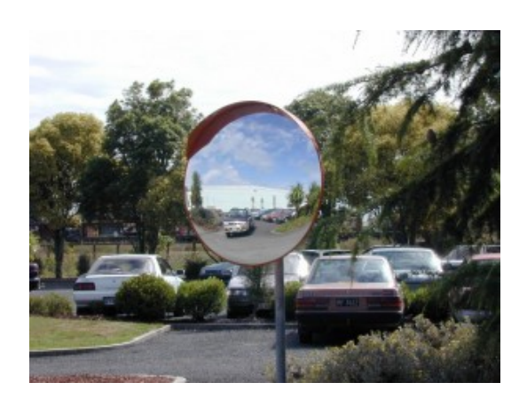
600mm Stainless Steel Anti-Vandal Mirror