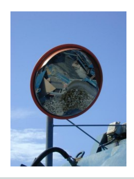
600mm Stainless Steel Anti-Vandal Mirror