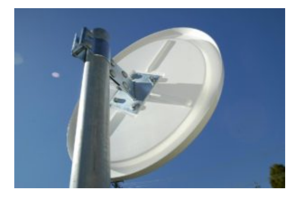
600mm Pro Series Traffic Mirror Fixing