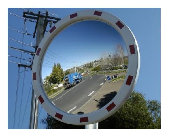
600mm Pro Series Traffic Mirror