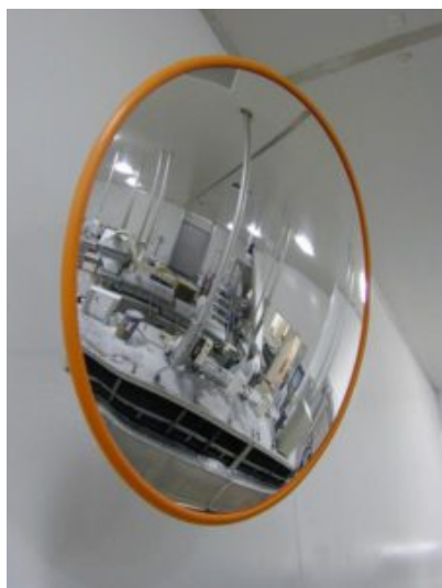
800mm Stainless Steel Food Processing Mirror