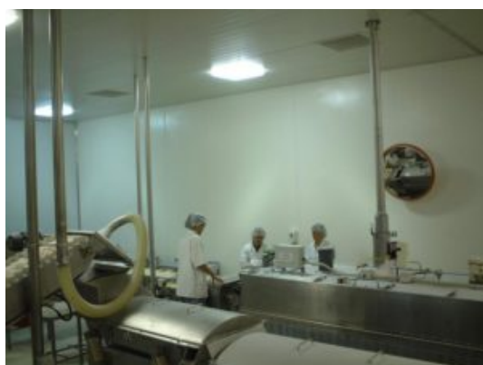
800mm Stainless Steel Food Processing Mirror