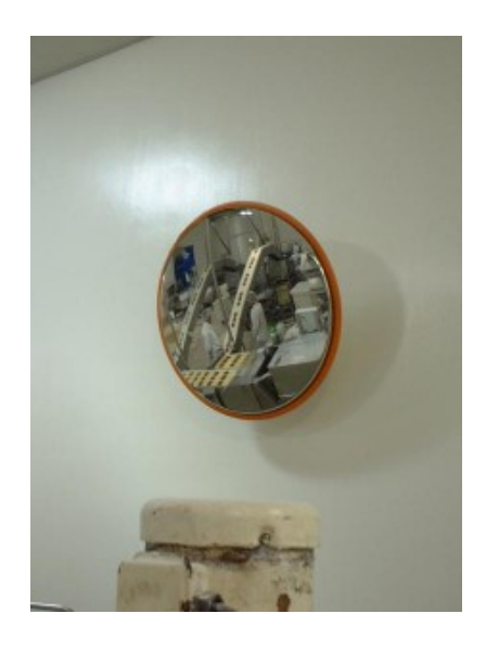
800mm Acrylic Food Processing Mirror